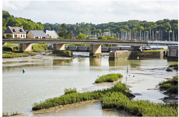
Le Châtelier lock and swing bridge

But in the spring of 2017 a new quayside scrubbing grid – cale de carénage – was opened right next to where we berth at Plouër-sur-Rance. Here, for a modest charge, you can dry out on the ebb and scrub off to your heart's content. All the nasty antifouling gunge drains into a sump and is pumped to a holding tank for collection and treatment. Water and electricity are on hand and the Restaurant de la Cale is just opposite. Available to any visiting yachts cruising in the St Malo area, the new facility is run by Plouër marina's helpful surveillante de port Liliane Faustin and her genial adjoint Thierry Baujard.