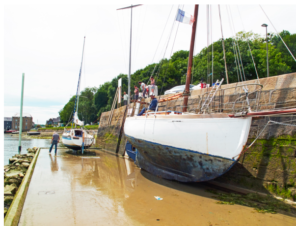
Scrubbing grid on the River Rance at Plouër.

For years shellfish producers had been lobbying for legislation against anti-fouling pollution, perfectly reasonably considering the vital importance of mussels and oysters on French restaurant menus. Enjoying these treats ourselves we sympathised with the new law, but for a traditional yacht of a certain age it was a flipping nuisance. Now we would have to be lifted out for scrubbing and anti-fouling, never so kind to an elderly wooden hull as settling down against some sleepy quay up a sheltered river.