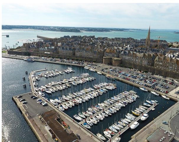
New port layout at St Malo Port Vauban

The marina at the north end of St Malo's locked Bassin Vauban has been substantially extended and refurbished, with new wider pontoons and a larger facilities block with more showers and WCs. To my mind, this makes what is now called 'Port Vauban' by far the best place to berth in St Malo. The outside marina at Port des Sablons has become a noisy place to stay overnight because of the continuous whining generator aboard the Condor fast ferry, which lies alongside right next to the marina basin. Several yachtsmen have reported to me that they no longer use Port des Sablons for this reason, and we don't berth there ourselves now.